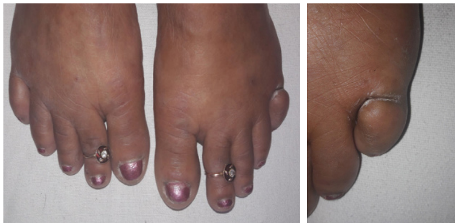
Fig 1: Bilateral grooving of fifth toe at the level of metatarsophalangeal joint and distal bulbous swelling (more prominent over left side)

The patient was experiencing a feeling of tightness and pain for the last 1 year, which aggravated for the past 15 days. There was no relation of pain to walking distance, but it increased on movement of digits. She was a villager from a hilly area and the practice of walking barefoot is common in this part of country. There was no history of obvious trauma, ulceration, gangrene, sensory loss, plantar keratoderma or any or any other neurovascular systemic diseases. She was a non-smoker and non-alcoholic. There was no family history of similar complaints. Physical examination had noted a circumferential constriction over the proximal metatarsophalangeal joint of both 5 th toes with distal bulbous swelling (Fig.1). Constriction band on left side was deeper than right side leading to 50%